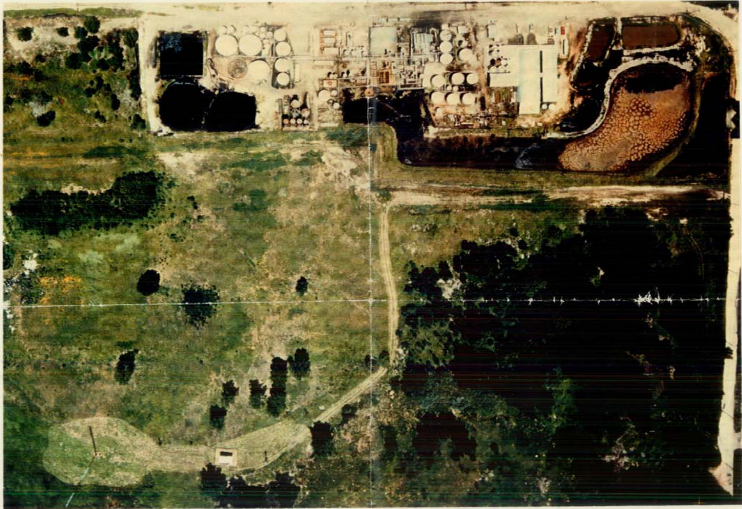
EMSL AERIAL PHOTO, 1985